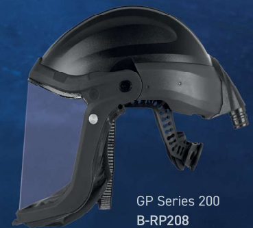
GP Series 200 B-RP208