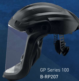
GP Series 100 B-RP207