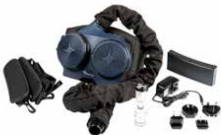
Evolution Air (Complete Blower Unit)