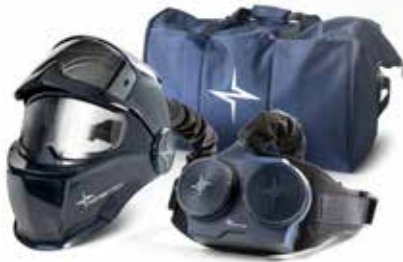
Evolution Vision 65F Air Kit with Evolution Vision 65F Air: