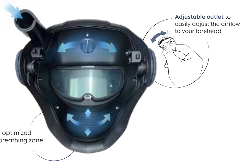
Main air streams for an optimized clean air supply to the breathing zone