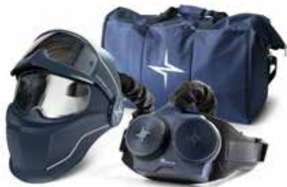
Evolution Vision 65FM Air Kit with Evolution Vision 65FM Air: